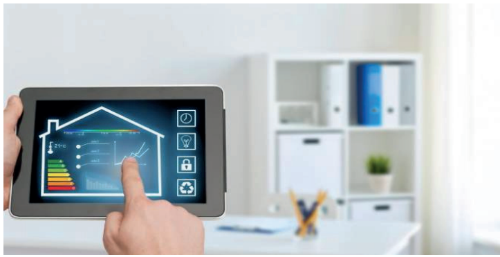
Figure 3 - Residential remote control (Kosten-haus,08/17/2021)

They can be controlled by remote controls, your smartphone and voice assistants. All the utensils that can be controlled by these devices make your daily use more practical, such as TVs, stereos, lamps, curtains and more.