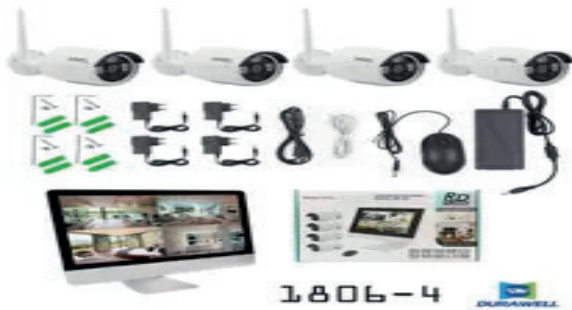
Figure 2 - Wireless surveillance system (Durawell)

According to WEG (a Brazilian multinational company headquartered in the city of Jaraguá do Sul, in the state of Santa Catarina), one of the biggest benefits of home automation is that the security system not only encompasses several automated resources, but also generates integration between them, further strengthening the protection of the home.