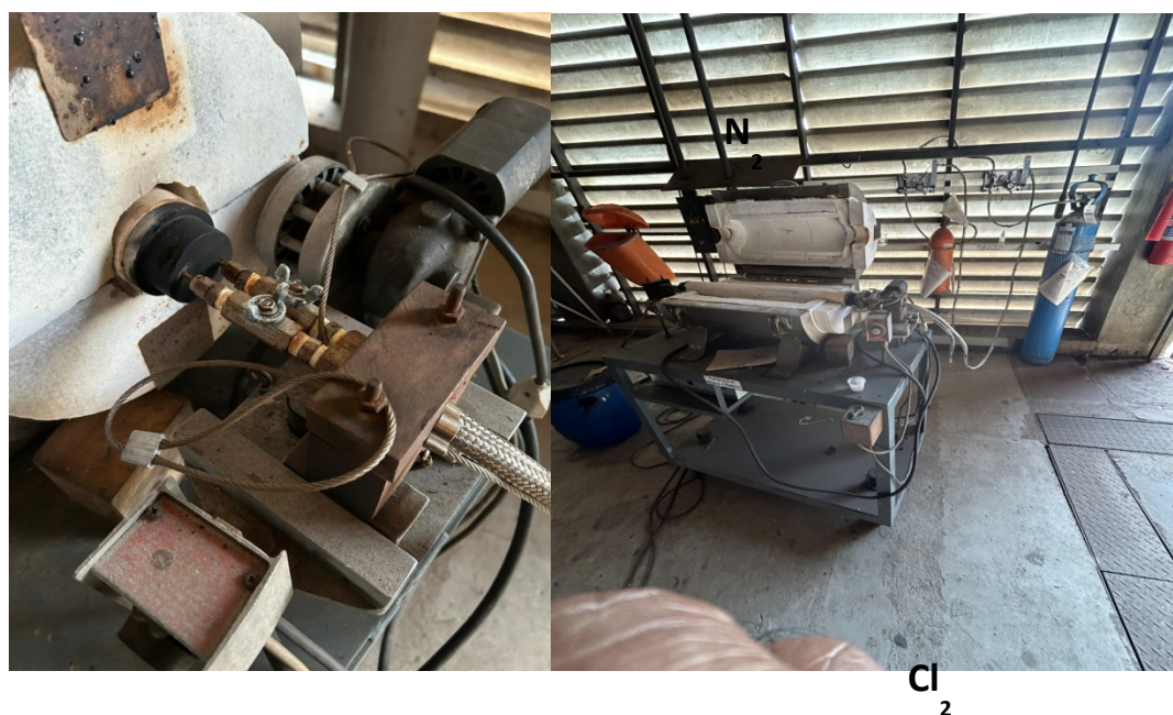
Fig. 2- Reaction system used in lithium extraction tests from exhausted lithium-ion batteries.

This system consists of a horizontal furnace, equipped with an alumina reactor where the exhausted batteries are inserted. At the beginning of the operation, the temperature range used was 400 to 500 °C, under a continuous flow of nitrogen so that the referred battery was destroyed in the absence of oxygen and humidity. Once this temperature was reached, a flow of chlorine gas was passed through the reactor for the proper transformation of the elements present ( i.e. , Li, Co and Mn) into the respective water-soluble chlorides.