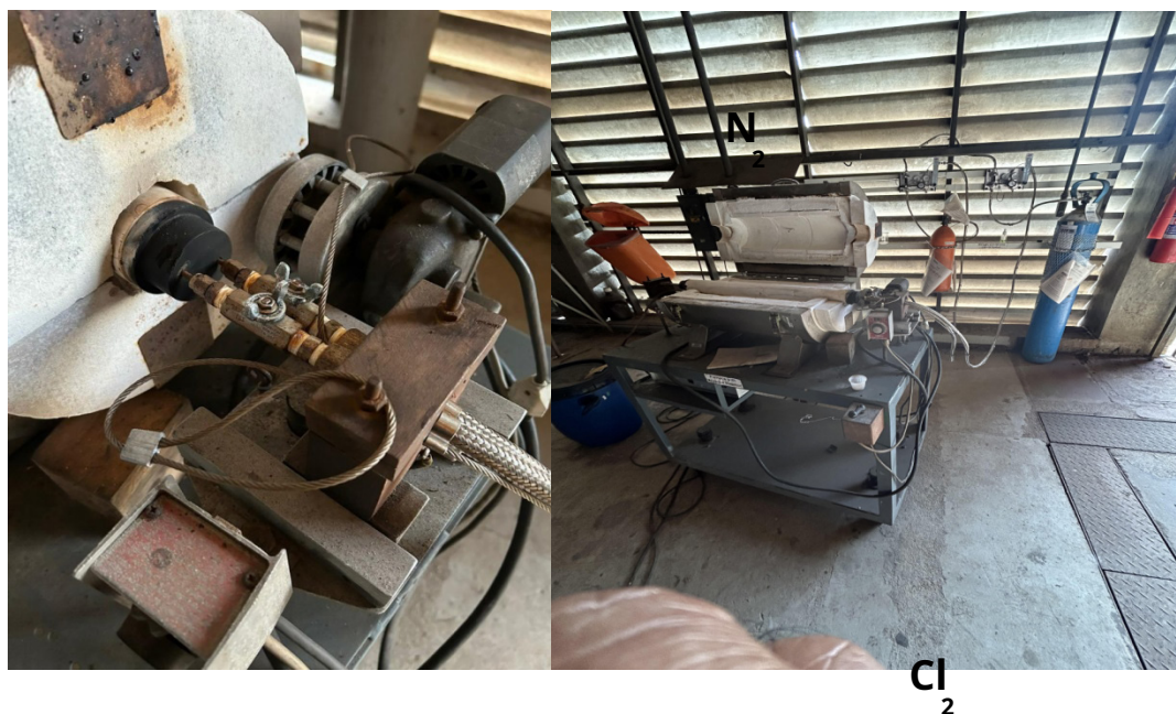
Fig. 2 -Reaction system used in lithium extraction tests from exhausted lithium-ion batteries.

This system consists of a horizontal furnace, equipped with an alumina reactor where the exhausted batteries are inserted. At the beginning of the operation, the temperature range used was 400 to 500 °C, under a continuous flow of nitrogen so that the referred battery was destroyed in the absence of oxygen and humidity. Once this temperature was reached, a flow of chlorine gas was passed through the reactor for the proper transformation of the elements present ( i.e. , Li, Co and Mn) into the respective water-soluble chlorides.